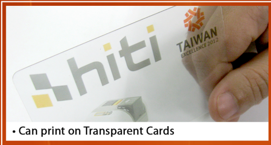
• Can print on Transparent Cards

Ideal Solution for Instant Issuance of ATM, School ID's and Loyalty Card